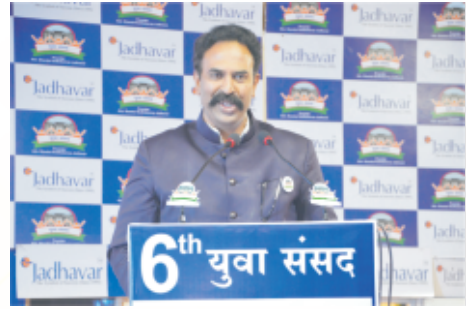
Mr. Ranjit Singh Naik Nimbalkar (MP, Maharashtra)