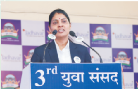
Smt Lalita Babar (Asia's Best Runner)