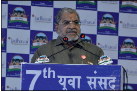
Hon. Raju Shetti (Organization Founded-Swabhimani Paksha)