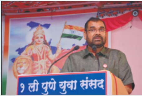
Mr. Sadabhau Khot (Minister of State, Maharashtra)