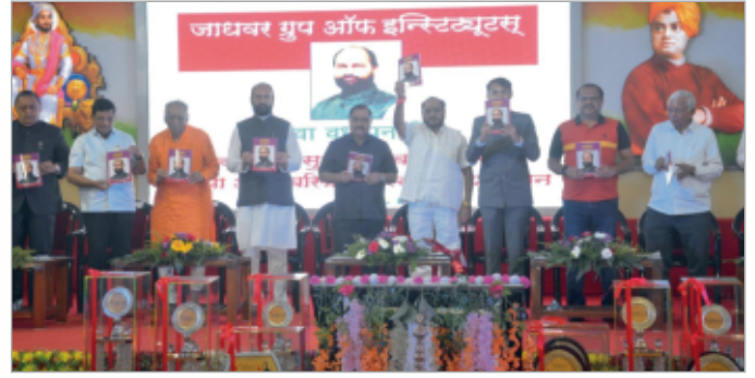
Foundation day of Jadhvar group of institute