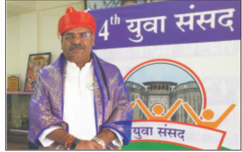
Mr. Shivajirao Adarrao Patil (MP, Maharashtra)