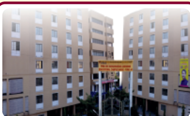
Prin.Dr. Sudhakarrrao Jadhavar Educational Campus (1), Narhe, Pune-41

Phone - 7888274117 www.paradiseems.co.in / www.jadhavarems.in / www.jadhavarsemienglish.in