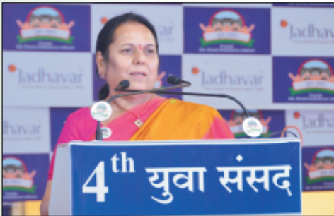
Smt. Neelam Tai Gore (Deputy Speaker, Legislative Council)