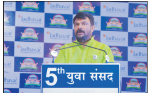
Mr. Hemant Patil (MP, Maharashtra)