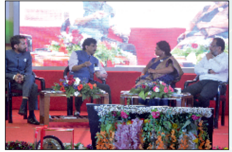
Mr. Sanjay Raut (Member of Rajyasabha) Smt. Sushmatai Andhare (Shivsena Spokesperson)