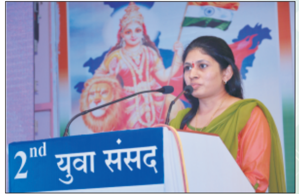
Smt. Rakshatai Khadse (MP, Maharashtra)