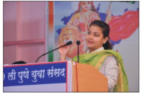
Smt. Praniti Tai Shinde (MLA, Maharashtra)