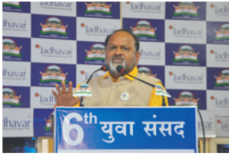
Mr. Mahadev Jankar (Former Cabinet Minister, Maharashtra)