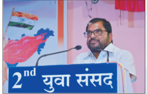
Shri Raju Shetty (MP, President - Farmers Swabhiman Association)