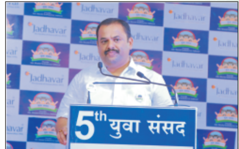
Mr. Prashant Jagtap (Former Mayor, Pune Municipal Corporation)