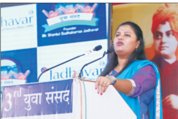
Smt. Dr. Hina Gavit (MP Maharashtra)