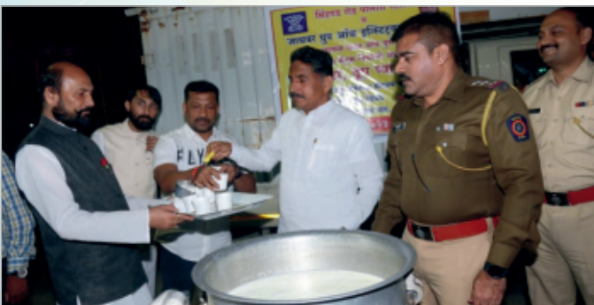
Daru soda Dhood Pya Abhiyan