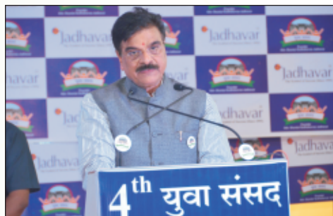
Mr. Vijaybapu Shivtare (Minister of State, Maharashtra)