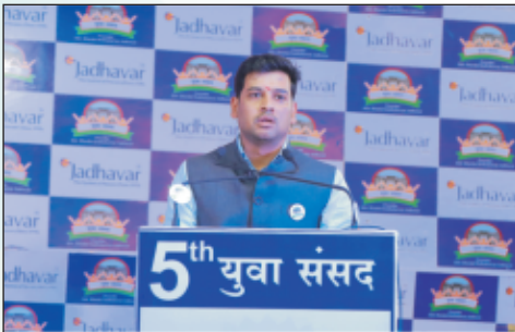
Mr. Shrikant Shinde (MP, Maharashtra)