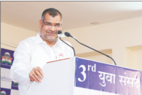
Mr. Sadabhau Khot (Minister of State, Maharashtra)