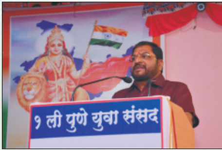
Shri Raju Shetty (MP, President - Farmers Swabhiman Association)