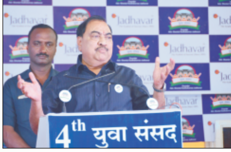
Mr. Eknath Khadse (Former Revenue Minister, Maharashtra)