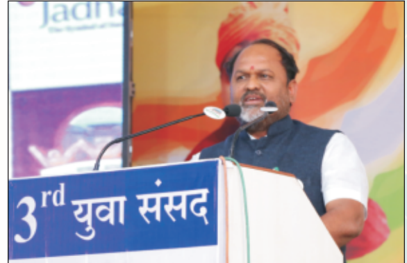
Mr. Mahadev Jankar (Cabinet Minister, Maharashtra)