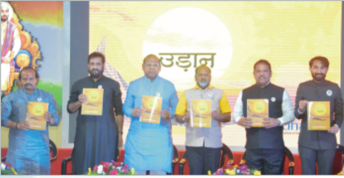
Udaan – Book inauguration at 5th Yuva Sansad