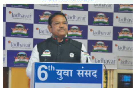
Mr. Srirang Barane (MP, Maharashtra)