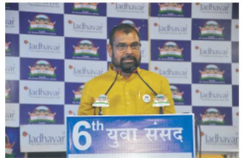
Mr. Sada Khot (Former Minister of State, Maharashtra)