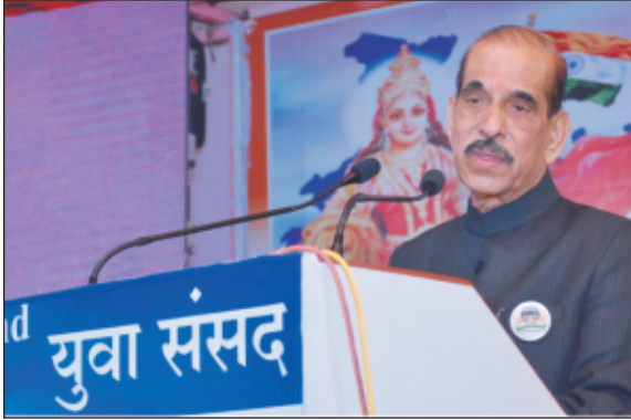
Shri Manohar Rao Joshi Sir (Former Chief Minister - Maharashtra, Former Speaker - Lok Sabha)