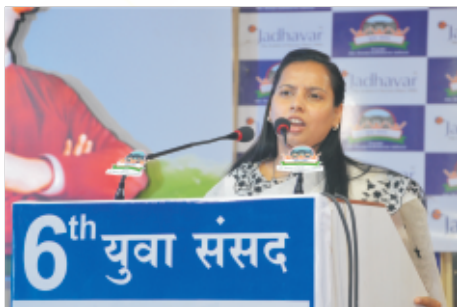
Smt. Aditi Tatkare (Cabinet Minister, Maharashtra)