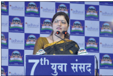
Smt. Rupalitai Chakankar (President-Maharashtra Rajya Mahila Ayog State Minister)