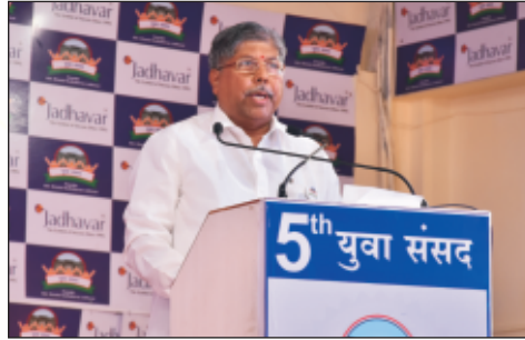
Mr. Chandrakant Patil (Cabinet Minister, Maharashtra)