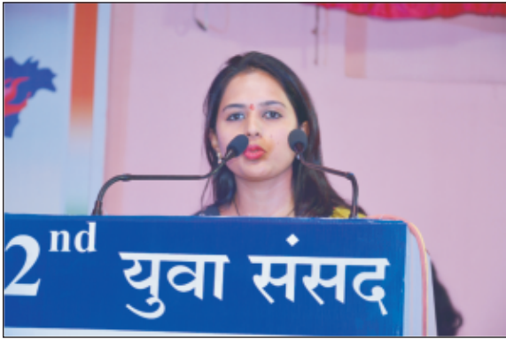
Smt. Pritam Tai Munde (MP, Maharashtra)