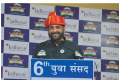
Mr. Imtiaz Jalil (MP, Maharashtra)