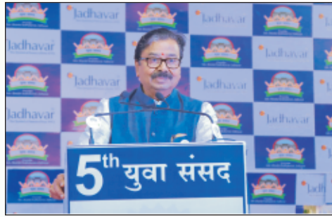
Mr. Gajanan Kirtikar (MP, Maharashtra)