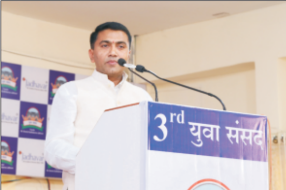
Mr. Dr. Pramod Sawant (Chief Minister of Goa)